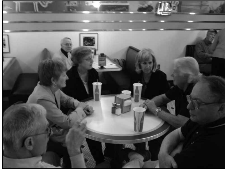
PURA members and their guests enjoyed an evening at Pappy's last spring.